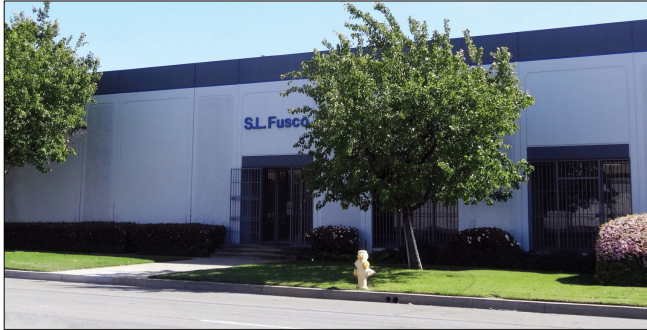
Rancho Dominguez, CA - Main Branch