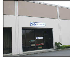
San Leandro, CA