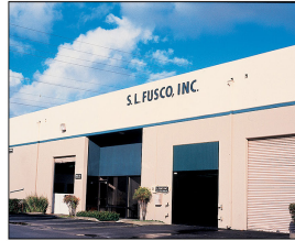
National City, CA